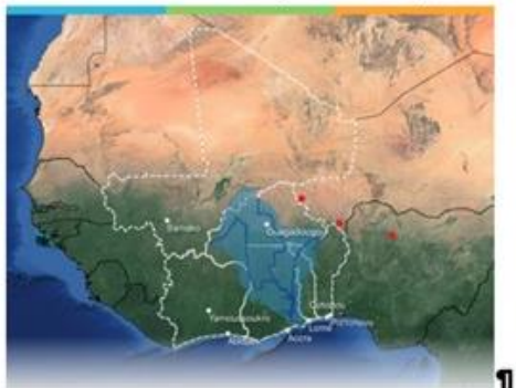
June-2023 (Final version for validation)