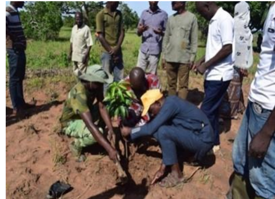
Tree nursery production and reforestation in Benin