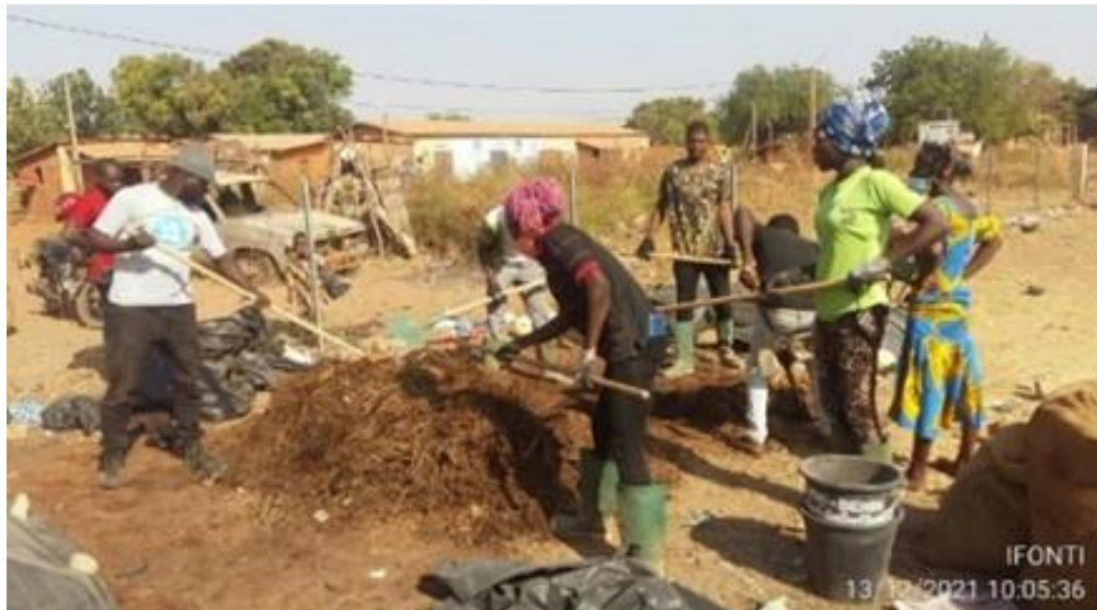
Production of compost from organic waste in Benin